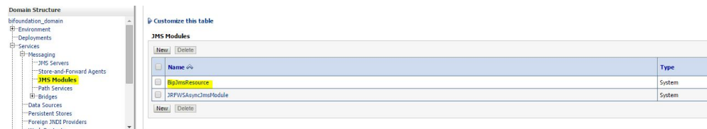
Figure 4-1 JMS Modules