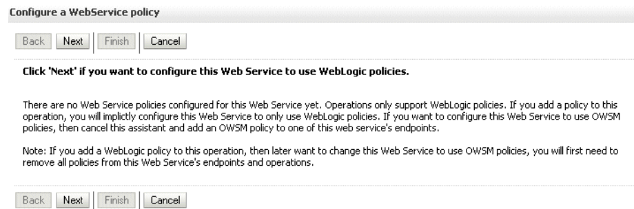
Figure A–3 WebLogic Server Policy Page