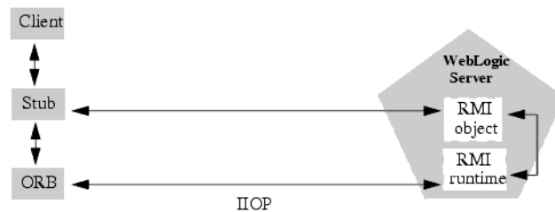
Figure 9–1 RMI Object Relationships