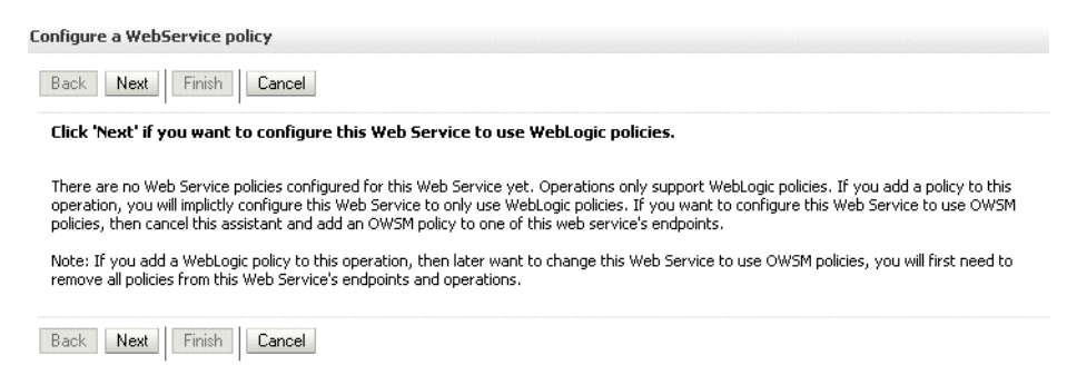
Figure A-3 WebLogic Server Policy Page

9. Select the Oracle WSM WS-Security policies that you want to attach to this Web service, and use the control to move them into the Chosen Endpoint Policies box, as shown in Figure A-4. Click Finish when done.