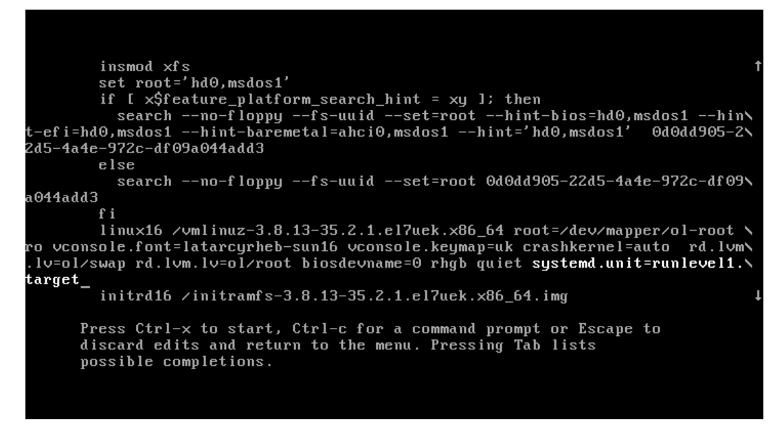
Figure 1-2 Kernel Boot Line with an Additional Parameter to Select the Rescue Shell

The following figure shows the kernel boot line with the additional parameter systemd.target=runlevel1.target, which starts the rescue shell.