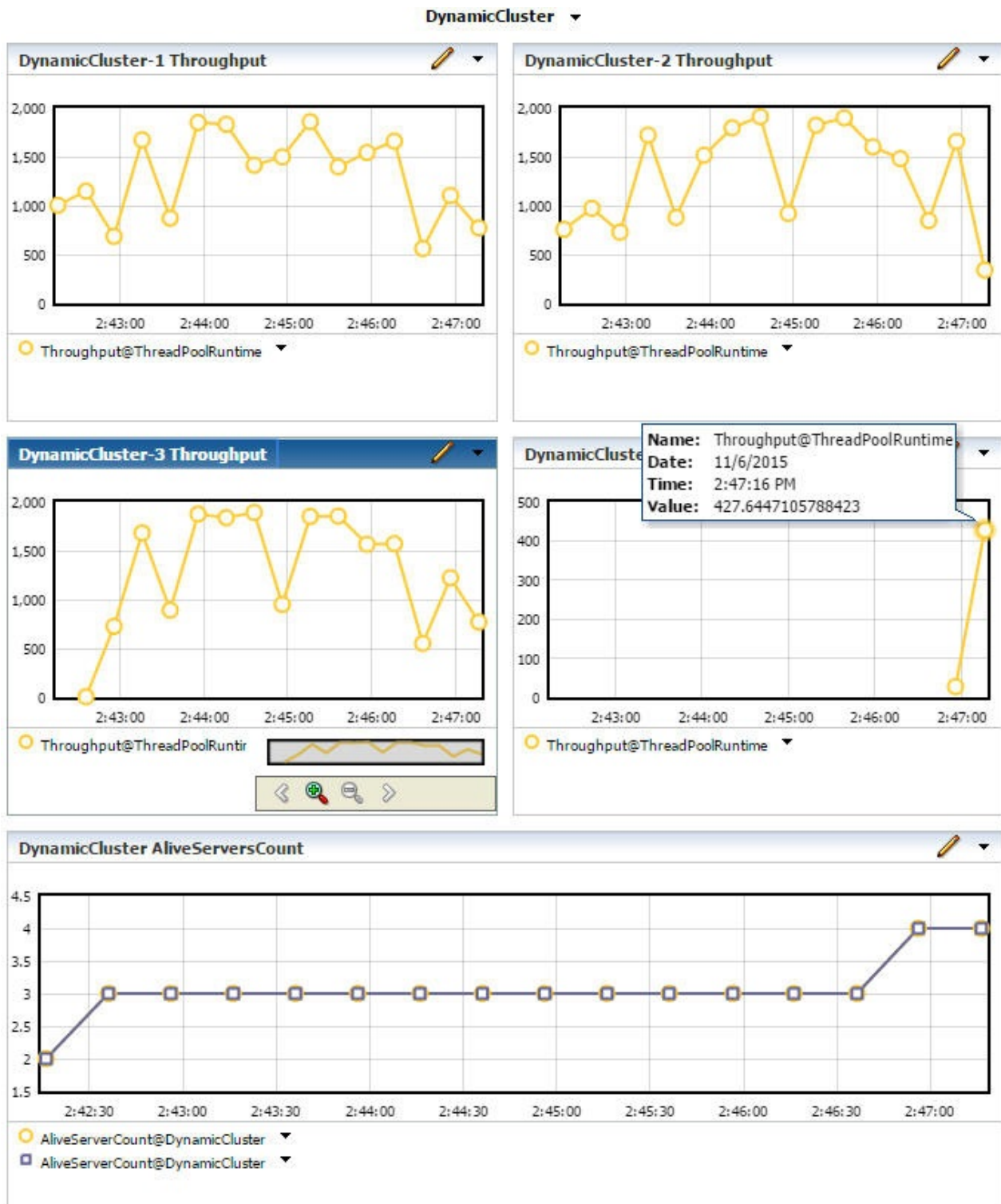
Figure 6-3 Dynamic Server Scaling Activity