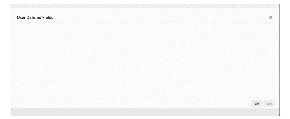
Figure 2-2 User define Fields

You can link the User Defined Fields with Bills & Collections Document Code Maintenance screen using User Defined Fields Function Field Mapping Maintenance screen.