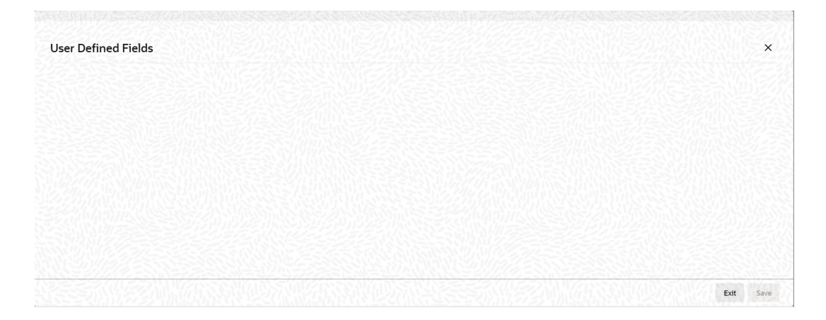
Figure 8-2 User Defined Fields

You can link the User Defined Fields with Branch Parameters Maintenance screen using Function field mapping screen which can be invoked from the Application Browser by selecting Common Entity, then Maintenance and then UDF Function Field Mapping. The value for these fields can be specified in the Branch Parameters Maintenance screen.