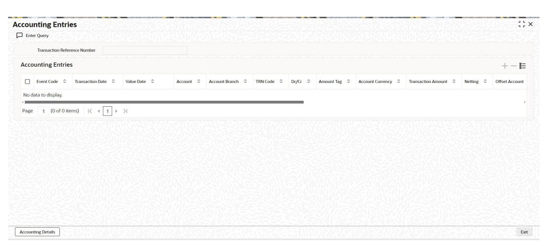
Figure 2-35 Accounting Entries

1. Click the Accounting Details tab and view the accounting entries for the transaction initiated.