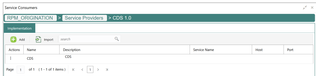
Figure 1-3 RPM_ORIGINATION - CDS