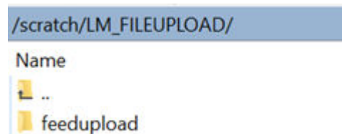
Figure 1-1 File Upload

Place the files to be uploaded under this folder.