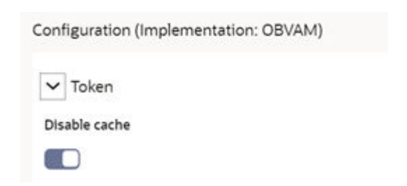
Figure 3-1 OBVAM service provider

Go to Edit of OBVAM service provider and update Authentication section for JWT token.