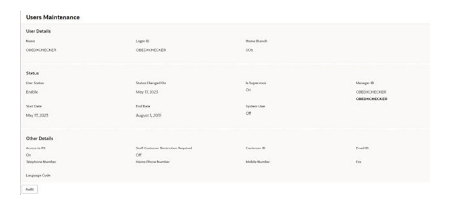
Figure 2-2 User Maintenance and Role Assignment