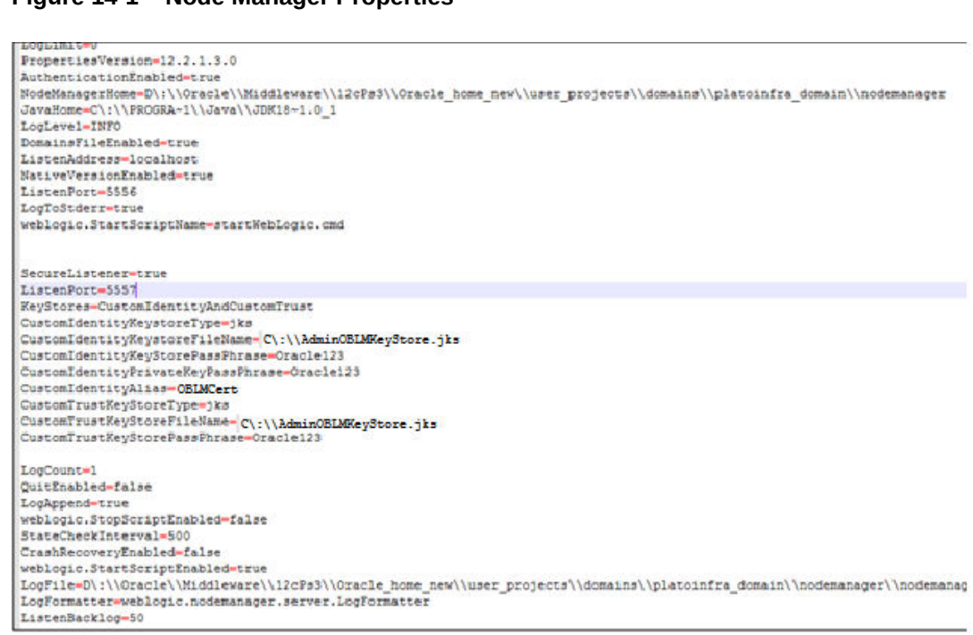
Figure 14-1 Node Manager Properties

Edit the nodemanager.properties with SSL configurations and restart the node manager. 1.