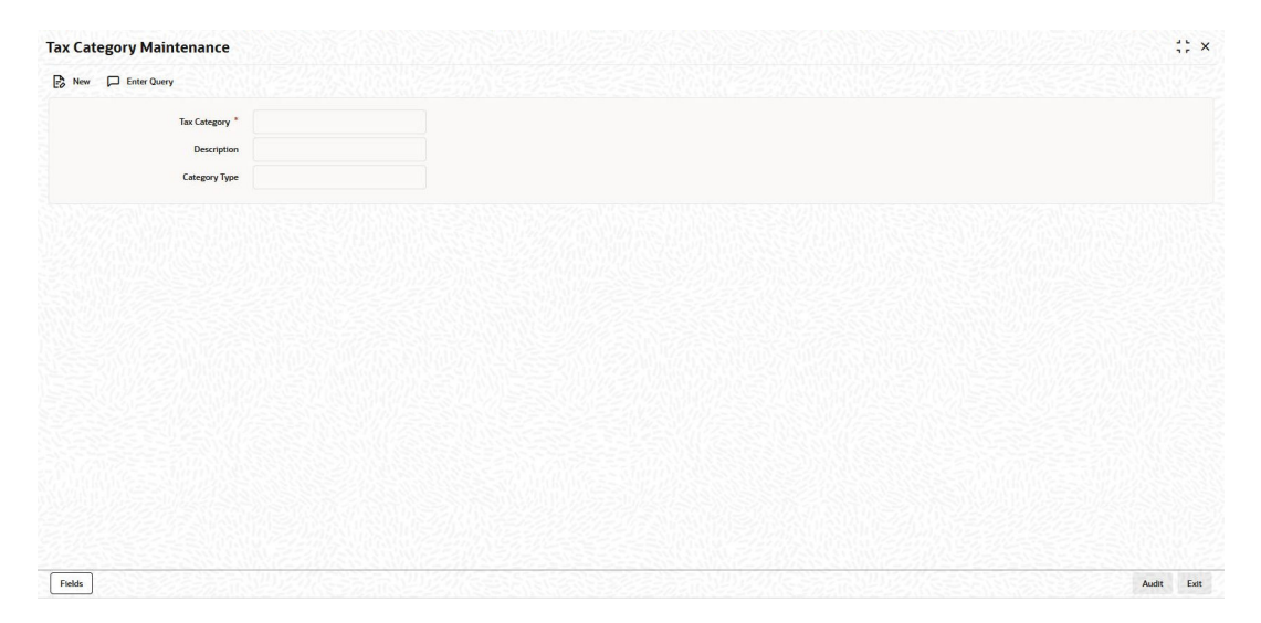
Figure 1-6 Tax Category Maintenance

2. You can enter below details in this screen. For information on fields, refer to the field description table.