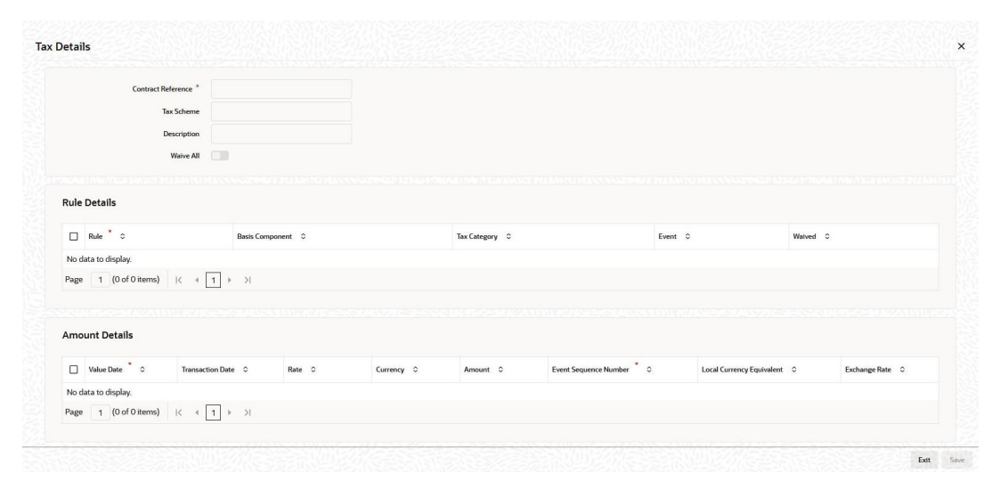
Figure 1-5 Tax Details

You have a choice of waiving tax due to all the tax rule(s) linked to the tax scheme applicable to the product (and hence the contract) or that which is only due to specific tax rule(s).