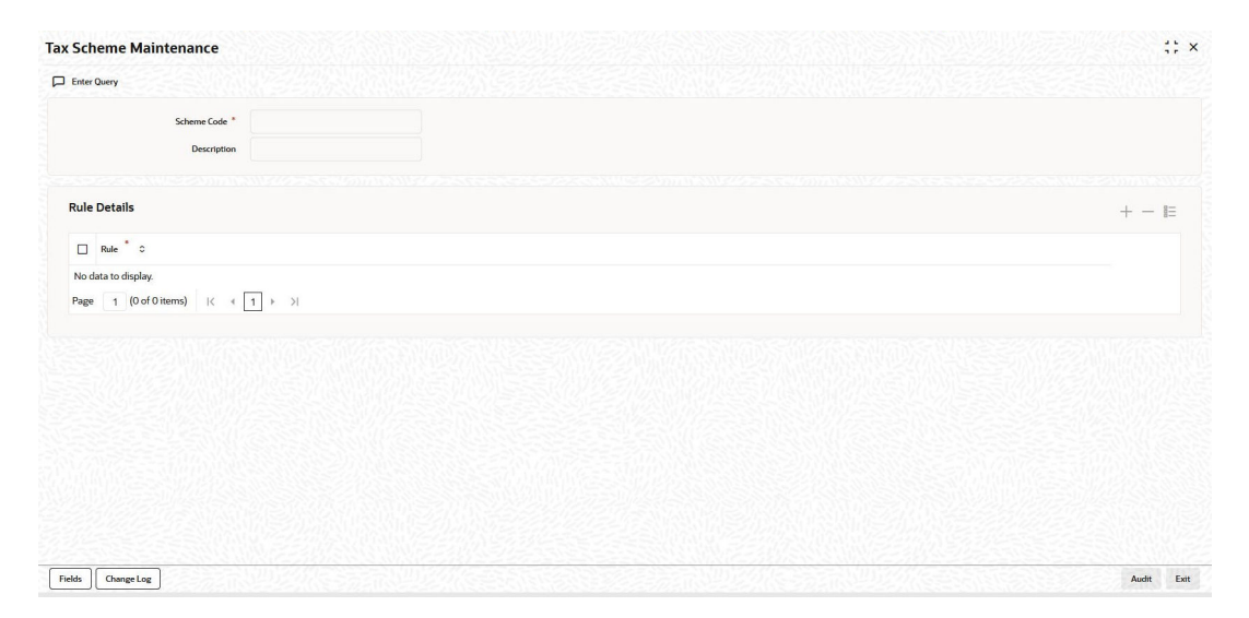
Figure 1-4 Tax Scheme Maintenance

2. You can enter below details in this screen. For information on fields, refer to the field description table.