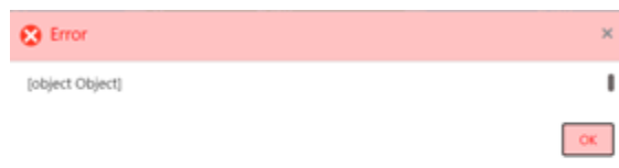
Figure 1-1 Object Error

You are not able to find an existing customer while initiating the process flow.