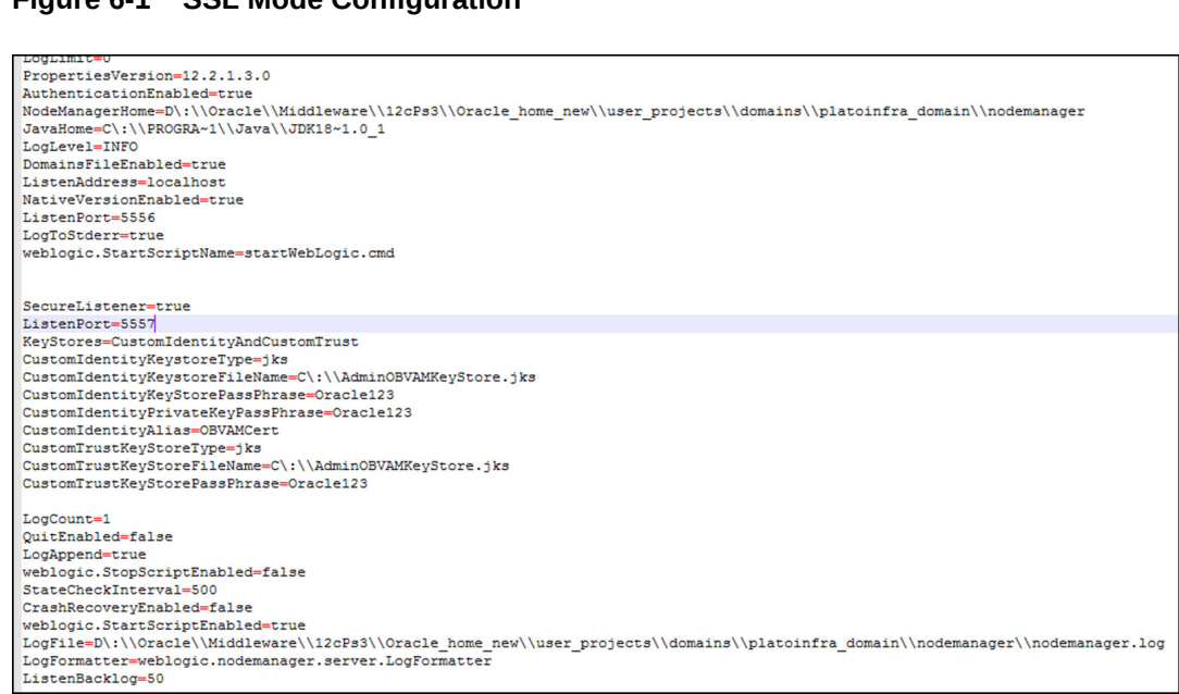
Figure 6-1 SSL Mode Configuration

1. Edit the nodemanager.properties with SSL configurations and restart the node manager.