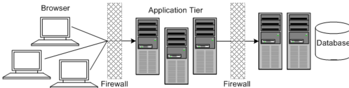
Figure 1-3 Clustered Server Deployment

In this scenario, the application tier is isolated by firewalls from both the Internet and the intranet. The database and servers are protected from potential attacks by two layers of firewall. Both firewalls can be configured to block known illegal traffic types. The two layers of firewall provide intrusion containment. Although there are a greater number of components to