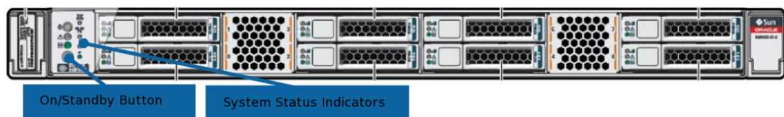
Figure 1-3 Front Panel