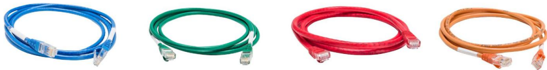
Figure 1-2 Cables