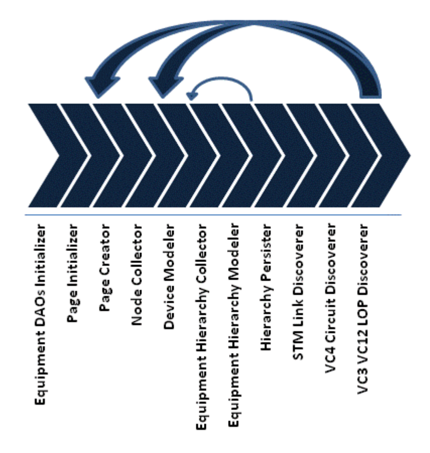
Figure 2-1 Import from MSS Action Processor Workflow