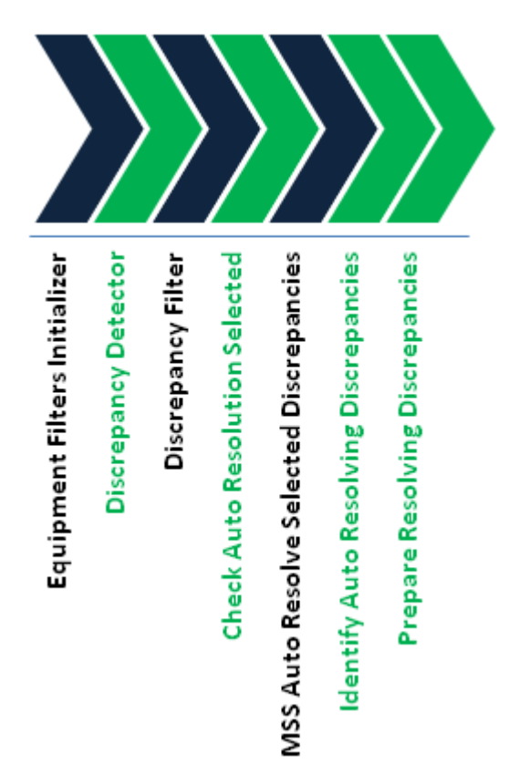
Figure 2-2 Detect Equipment Discrepancies Action Processor Workflow