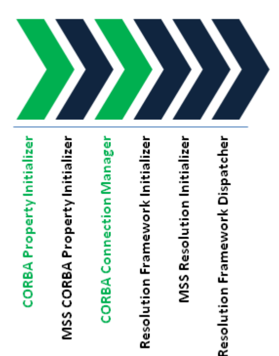
Figure 2-4 Resolve in MSS Action Processor Workflow

Figure 2-4 illustrates the processor workflow of the Resolve in MSS action.