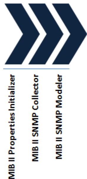
Figure 2-1 Discover MIB-II SNMP Action Processor Workflow

Figure 2-1 illustrates the processor workflow of the Discover MIB-II SNMP action.