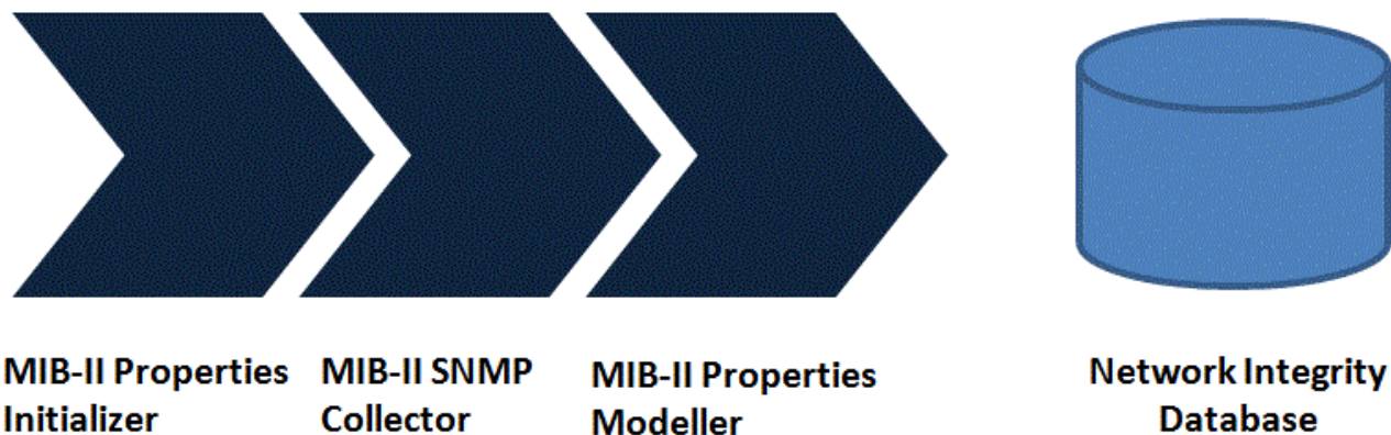
Figure 5-1 Discover MIB-II SNMP Action Chain

Figure 5-1 depicts the Discover MIB-II SNMP action chain.