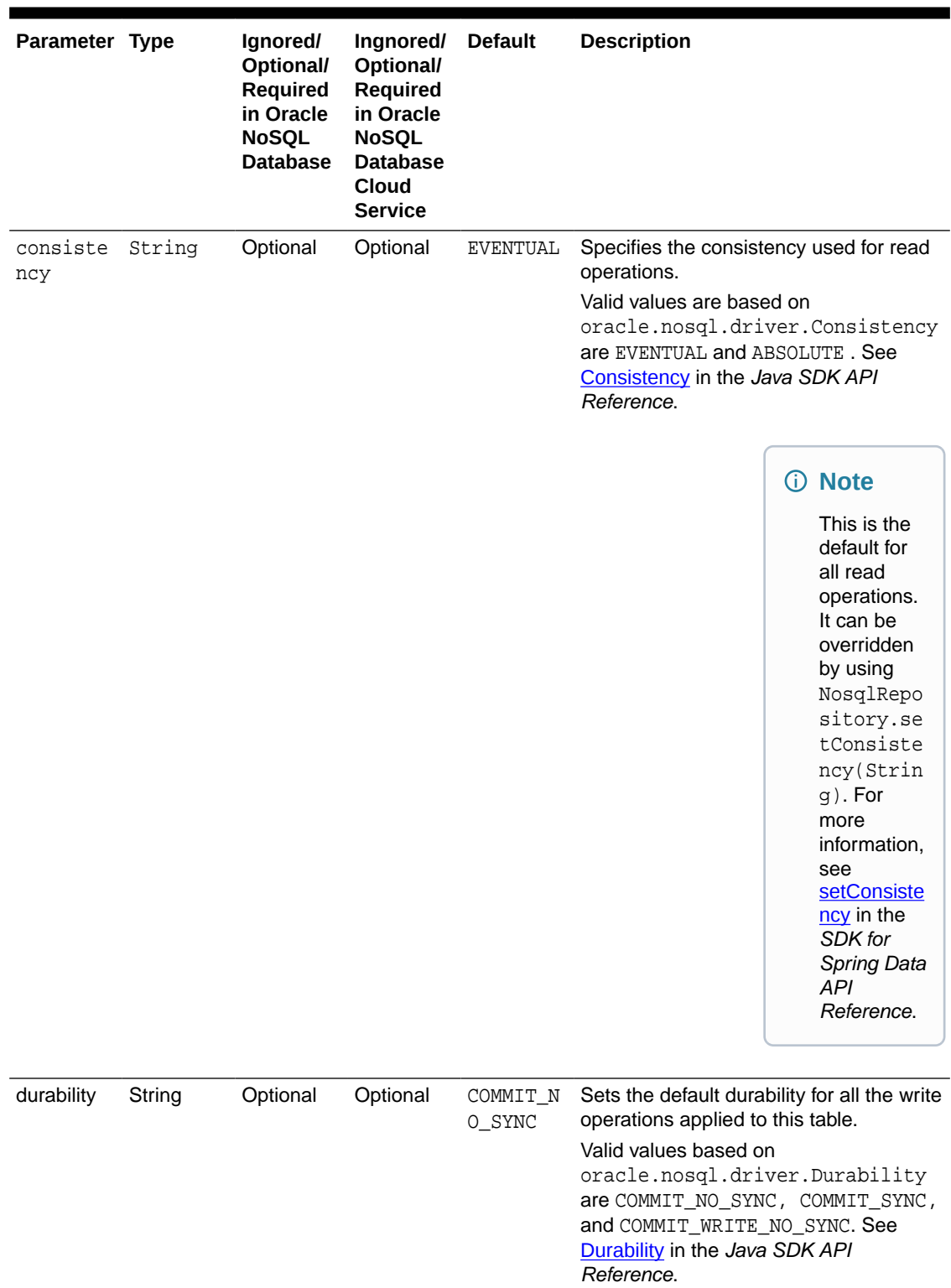
Table 1-1 (Cont.) Attributes in NosqlTable Annotation