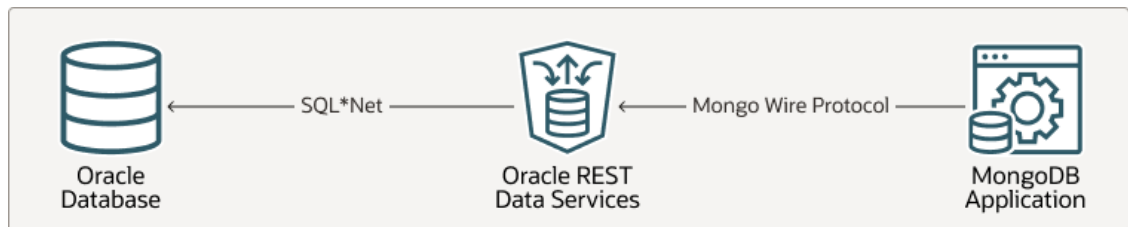
Figure 9-1 Architecture Diagram for Oracle Database API for MongoDB

Starting with ORDS release 22.3, Oracle REST Data Services supports the Oracle Database API for MongoDB when running in a standalone mode. This enables the use of MongoDB drivers, frameworks, and tools to develop your JSON document-store applications against the Oracle Database. The Oracle Database API for MongoDB, translates the MongoDB wire protocol into SQL statements that are executed using the ORDS connection pools.