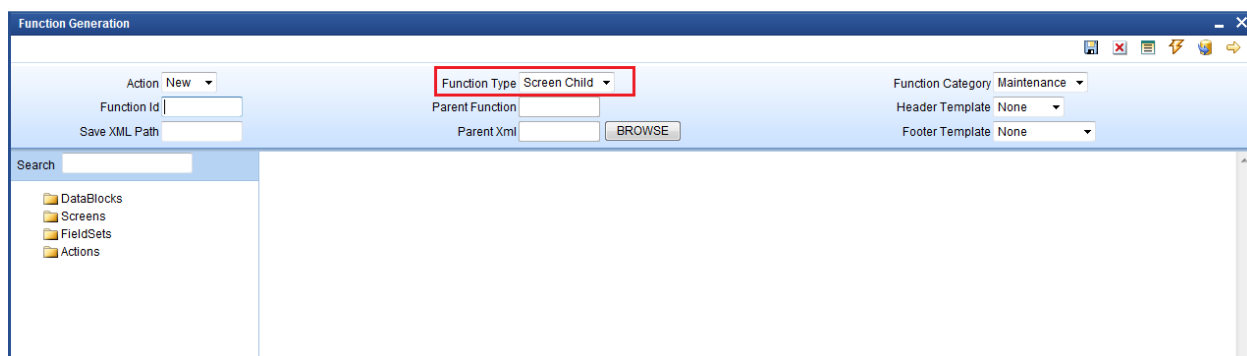
Fig 4.1: Screen Child Option to be selected

Only 4 nodes of the parent can be modified in a Screen Child