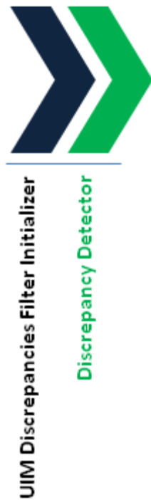
Figure 2–3 Abstract Detect UIM Discrepancies Action Processor Workflow