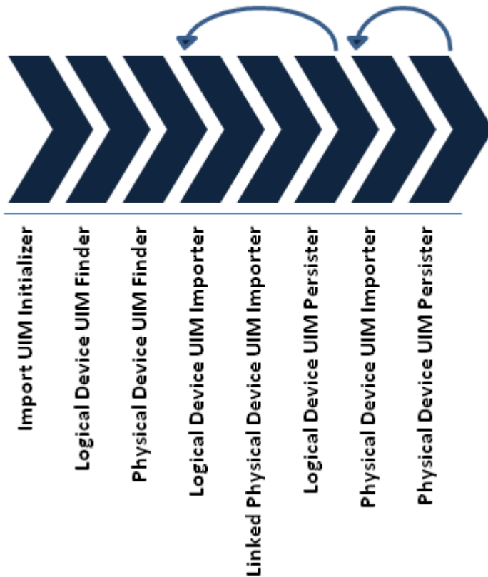
Figure 2–1 Abstract Import from UIM Action Processor Workflow