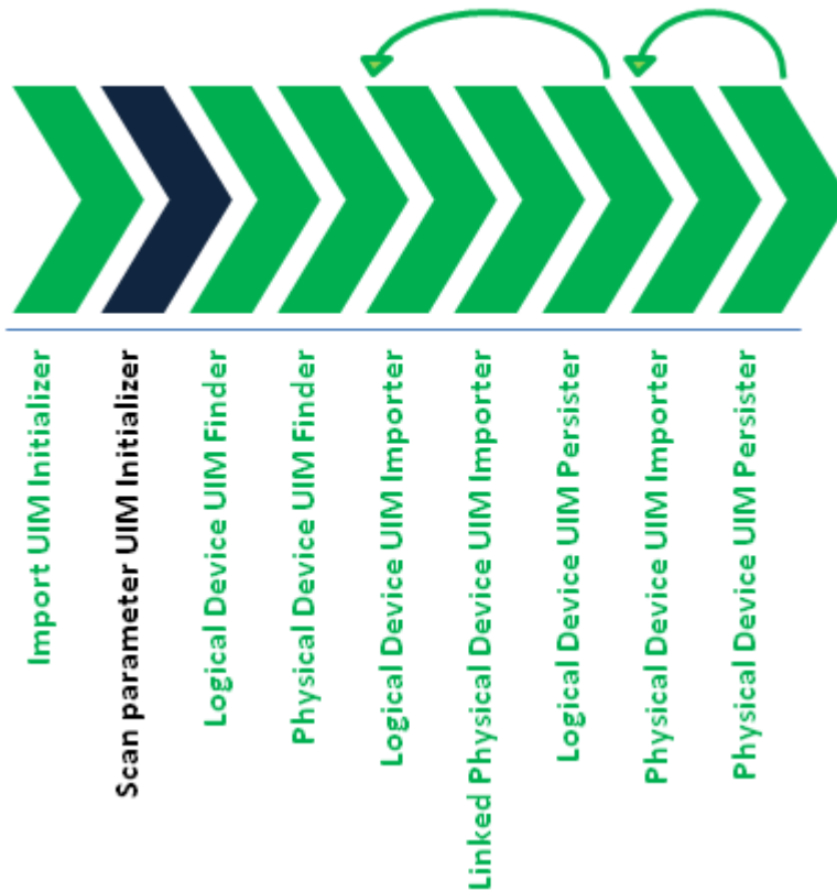
Figure 2–2 Import from UIM Action Processor Workflow