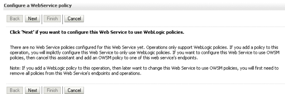
Figure A–3 WebLogic Server Policy Page