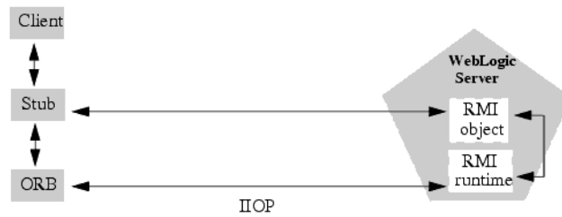
Figure 7-1 RMI Object Relationships