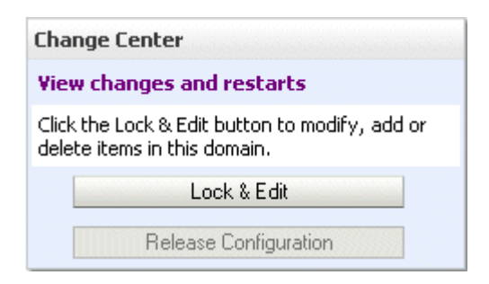
Figure 1 Change Center

This is the starting point for using the Administration Console to make changes in WebLogic Server. See Section 3.4, "Using the Change Center."