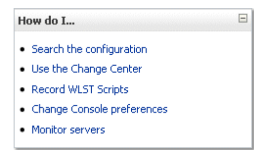
Figure 3 How do I...

This panel includes links to online help tasks that are relevant to the current Console page.