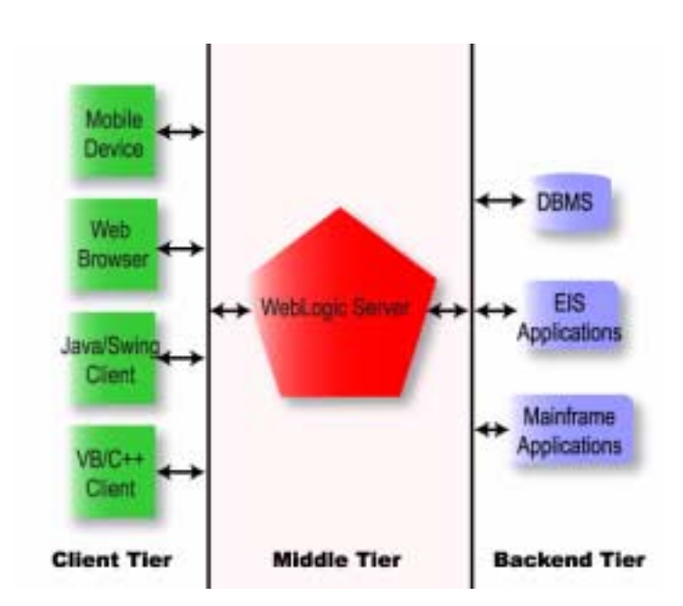
Figure 1-1 Three-Tier Architecture