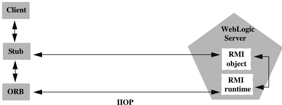
Figure 7-1 RMI Object Relationships

Figure 7-1 shows RMI Object Relationships for objects that use IIOP.