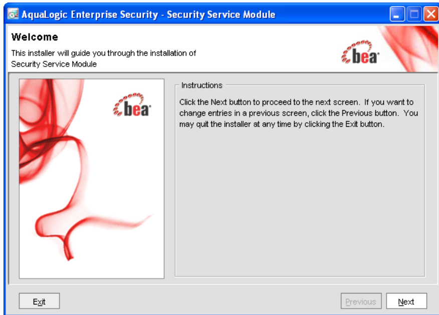
Figure 4-1 AquaLogic Enterprise Security SSM Installer Window